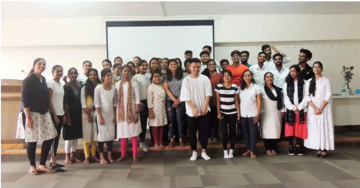
Students presence made the yoga day successful. The session ended with the Group photo.